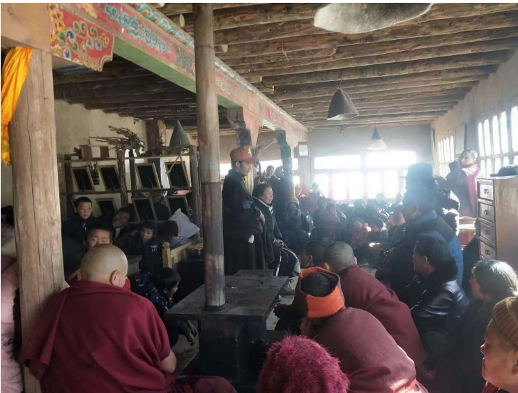
First training at project site, located in Nangqian County, Yushu Tibetan Autonomous Pref., Qinghai Province, 4100m.

The main aim is to provide 15 greenhouses and benefit as many families as possible: the project started on January 2020 with the construction and planting postponed because of CoVid19. Construction started on April and hopefully the first vegetables will be ready to eat within 2020.