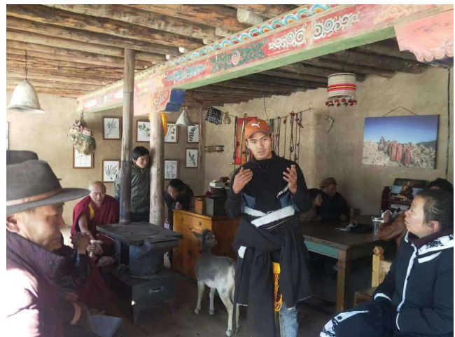
Community meeting with the representatives from 54 herder families.